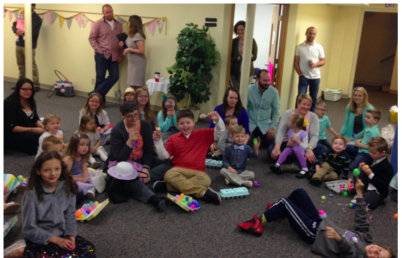
Children after their Egg Hunt.

We want to thank our children for helping us with the waving of the palms on Palm Sunday, for escorting our choir members into the worship service, and for leading us in song. Thank you for continuing to serve us in the many ways you do!