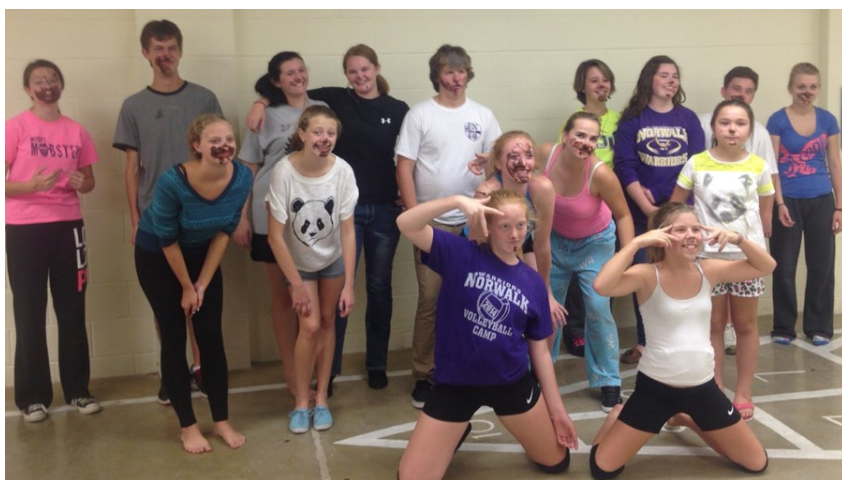
Youth Game Night (pictured above)

*Don't forget to read about our upcoming Candy & Costume Party!